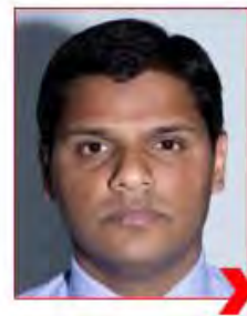
Shadows on image and background