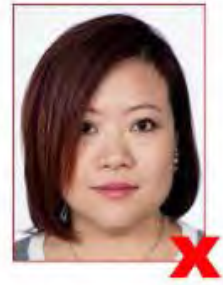
Hair obscuring face