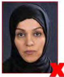
Background too dark