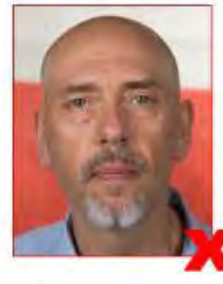
Background not plain