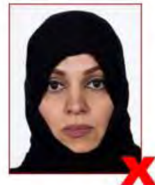
Eyes/edges of face obscured