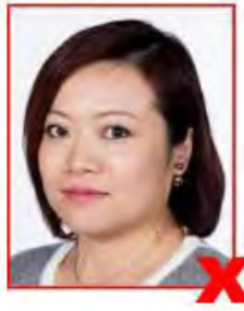
Side on to camera